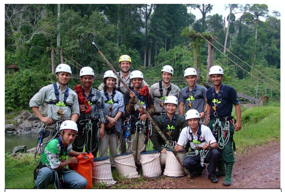
'Training Course For Trainee Climbing Trainers' Students and trainers from week one of the Sabah course 2005.