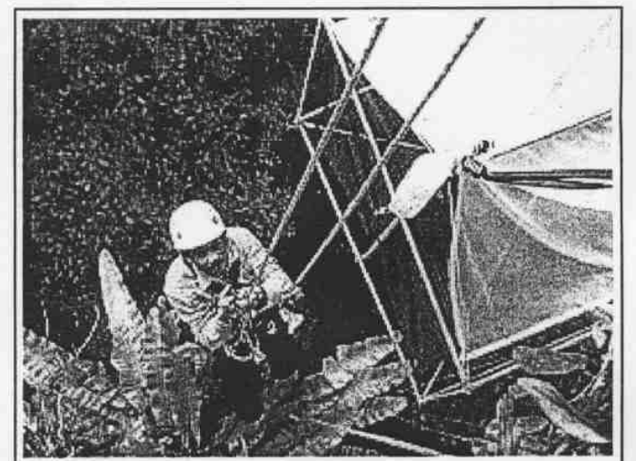
Dr Xiaodong Yang from China checks a Malaise trap at 40m

Initial training was carried out at low-levels on small trees adjacent to the Danum Valley Field Centre, but all participants also climbed high into the canopy, scaling epiphyte rich dipterocarps to heights of 45m. The training site was particularly rich in wildlife with frequent incidences of Orangutans and other primates watching the climbers from nearby branches.