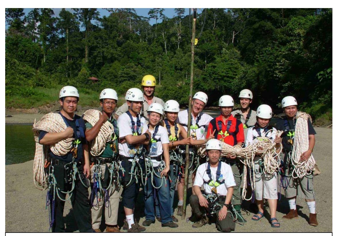
'Training Course For Trainee Science Trainers' Students and trainers from week two of the Sabah course 2005