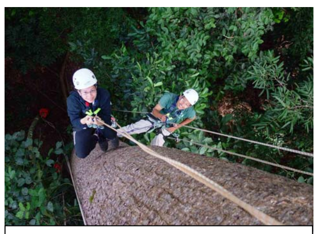
Students from Sabah and the Phillipines make their first high climb